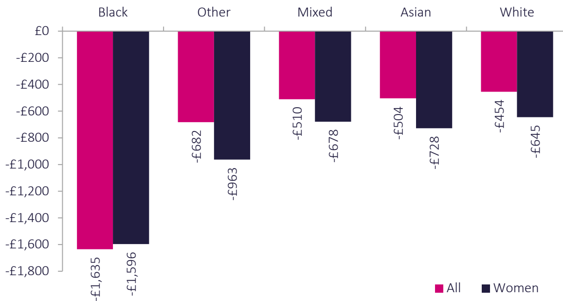
Figure 3: Real terms change in average (mean) cash benefits received between 2011 and 2020 by ethnicity 18

Note: Breakdowns are at the family (benefit unit) level in 2020/21 prices